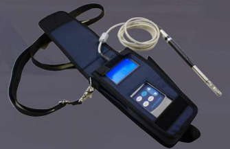
Hands-free Case now available!