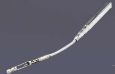
Telescopic, articulating probe